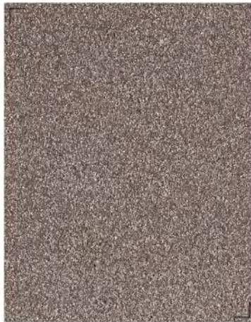
KNOP KIERRE BROWN