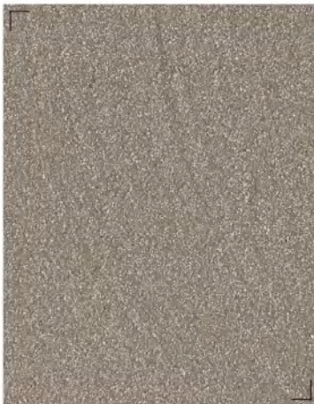
DRIE MAN CAN