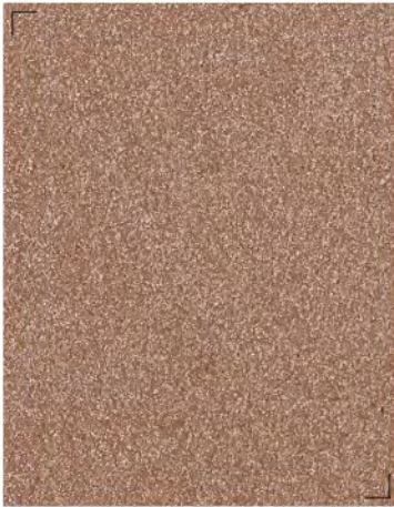
PAP EN WORS